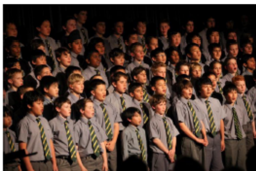
Year 7 Massed Choir performing at the Evening of Music 2012

Information Afternoon Tuesday 5 March 2013 4 – 7 pm