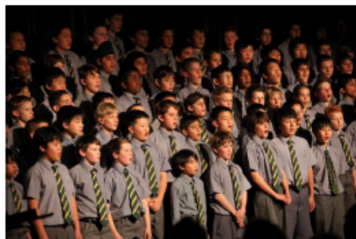
Year 7 Massed Choir

Information Afternoon Thursday 27 February 2014 4 – 7 pm